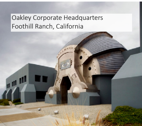
Oakley Corporate Headquarters Foothill Ranch, California