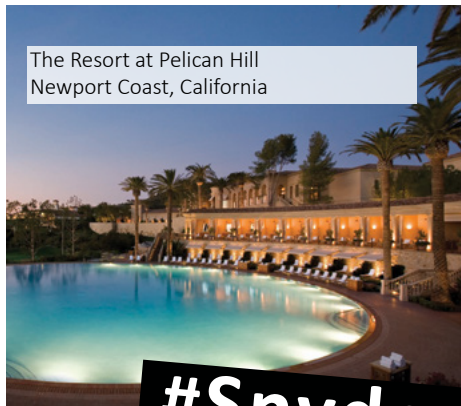
The Resort at Pelican Hill Newport Coast, California