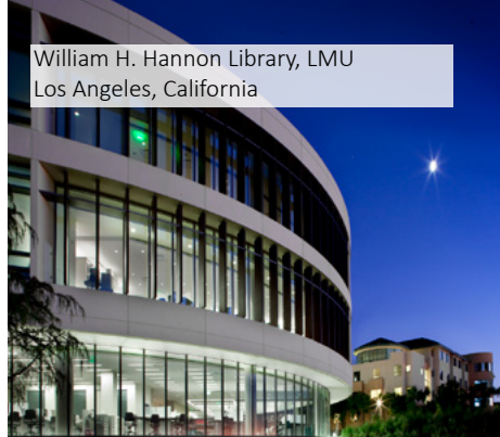
William H. Hannon Library, LMU Los Angeles, California