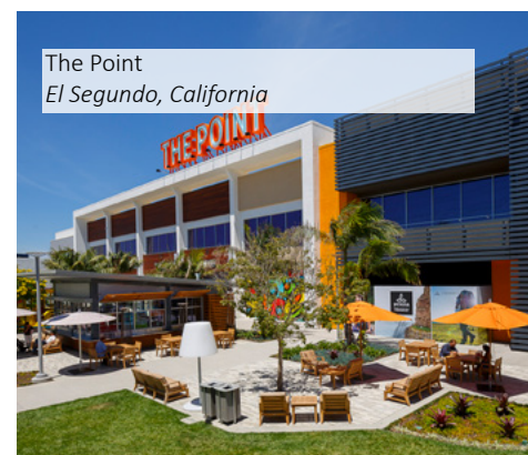
The Point El Segundo, California