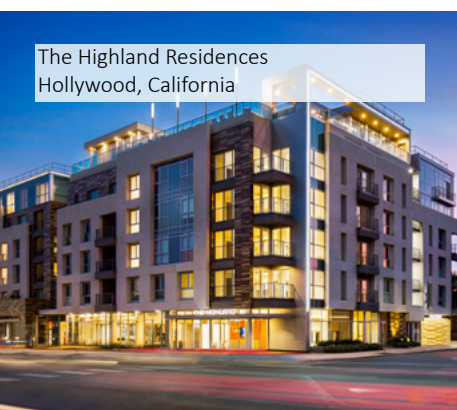
The Highland Residences Hollywood, California