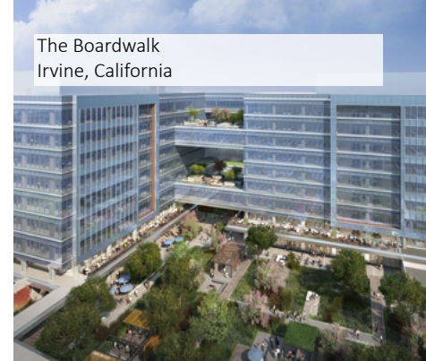
The Boardwalk Irvine, California