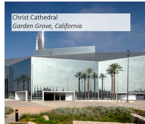
Christ Cathedral Garden Grove, California