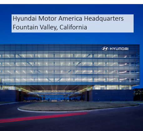
Hyundai Motor America Headquarters Fountain Valley, California