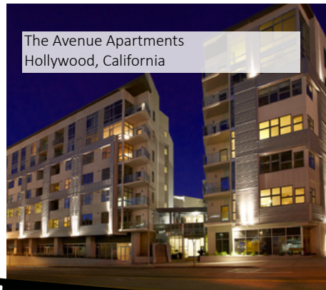
The Avenue Apartments Hollywood, California