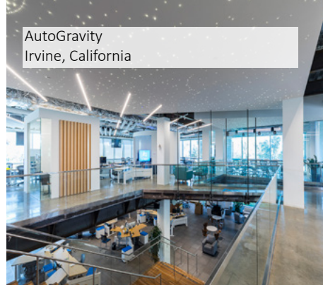
AutoGravity Irvine, California