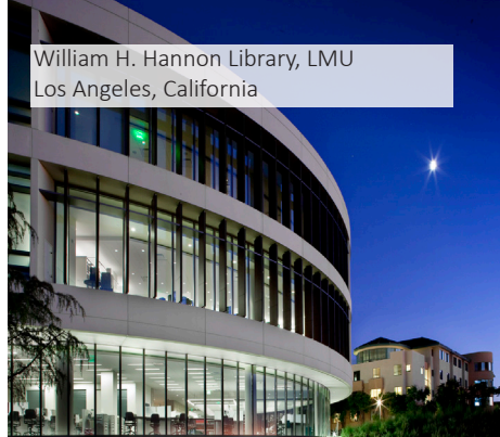
William H. Hannon Library, LMU Los Angeles, California