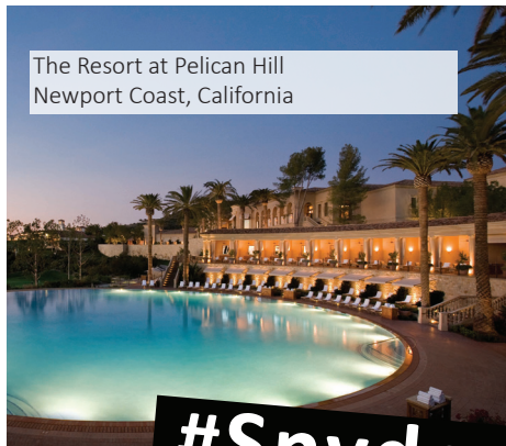
The Resort at Pelican Hill Newport Coast, California