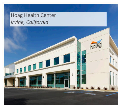
Hoag Health Center Irvine, California

COMMERCIAL MULTIFAMILY HEALTHCARE TENANT IMPROVEMENTS