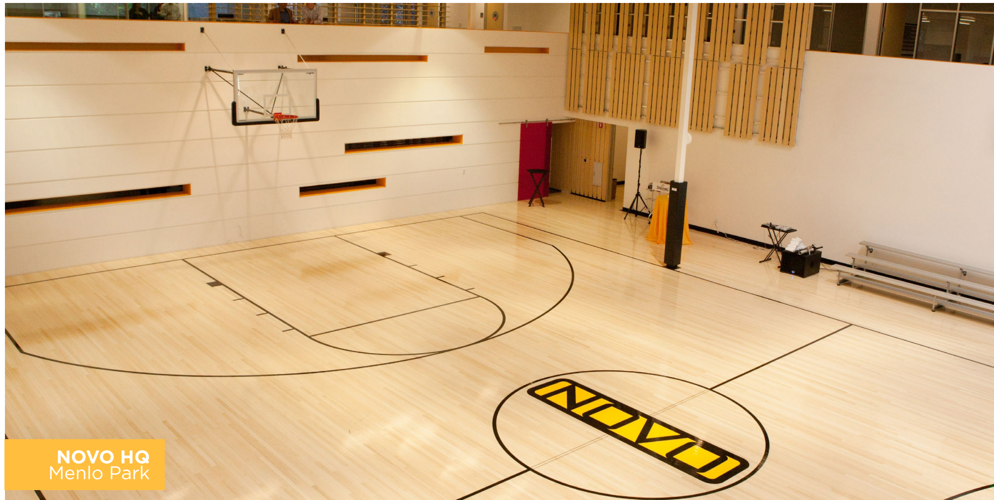
NOVO HQ Menlo Park